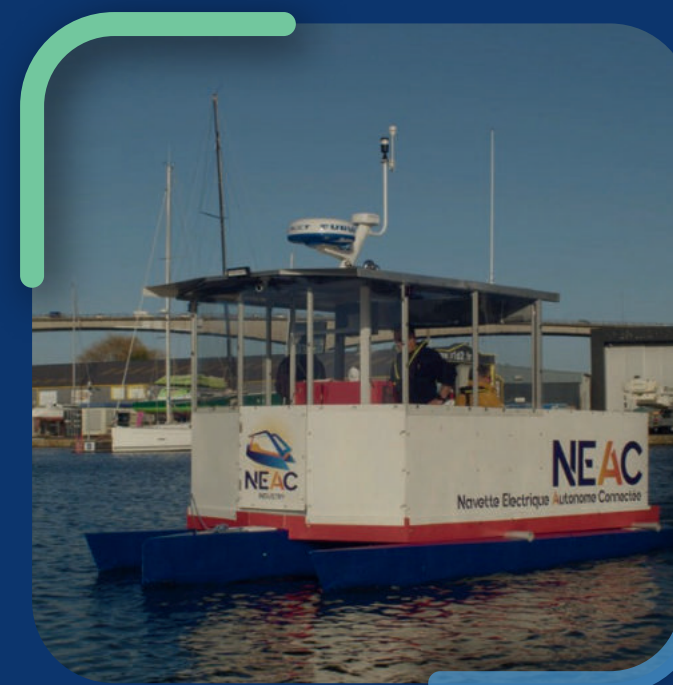
Living Lab 2 Caen, France

Living Lab 2 in Caen, France will create and validate an inventive trimaran vessel design and prototype, aligning with the SFAZ concept. This innovative watercraft is intended for the transportation of goods within urban and intra-urban areas in Caen and Le Havre (Normandy – Natura 2000), using the NEAC platform. While the testing in Caen will take place in a real-life environment, the one in Le Havre will be conducted through simulation.