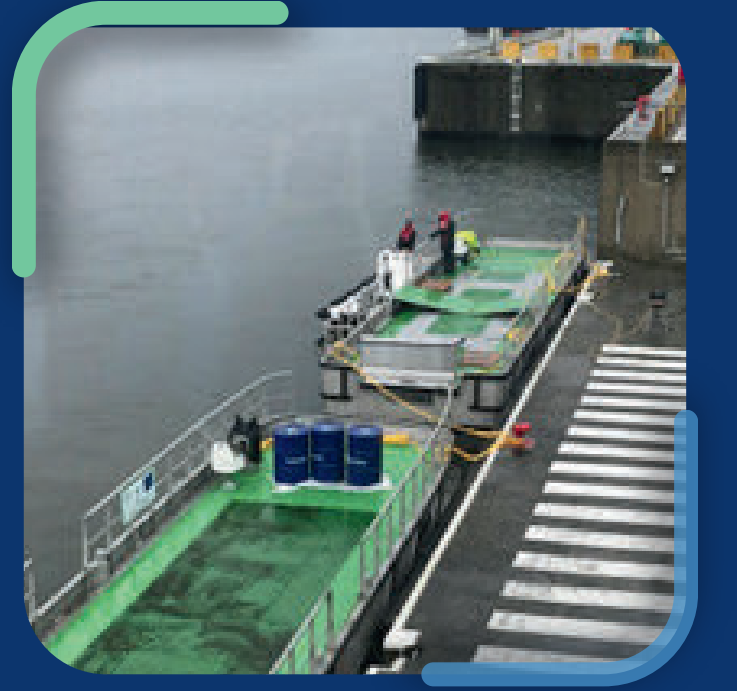
Living Lab 1 Ghent, Belgium

Living Lab 1 in Ghent, Belgium is set to advance and trial an eco-friendly SFAZ vessel solution designed for the urban and intra-urban transport of goods in the Ghent region. This initiative involves retrofitting the currently under-construction AVATAR vessel, customised specifically for urban transport needs, and ensuring its discoverability by logistics players to facilitate new markets for modal shift.