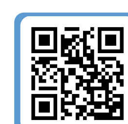
Living Lab 3 Galati, Romania